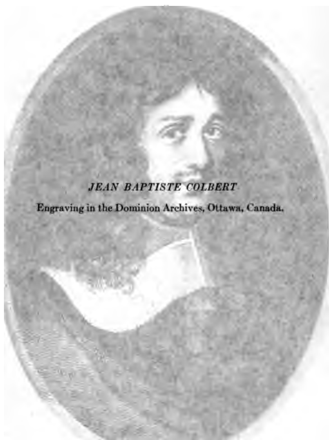
JEAN BAPTISTE COLBERT

Engraving in the Dominion Archives, Ottawa, Canada.